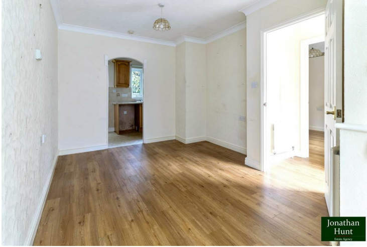
LOUNGE DINER 18'4" x 9'10" (5.6 x 3.0)